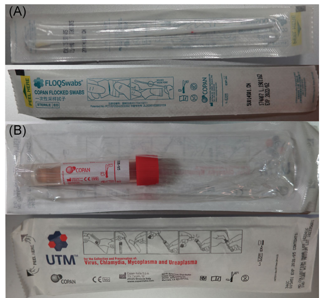
FIGURE 1 Conjunctival swab technique used to collect tears and conjunctival secretions. A, Conjunctival swabs; B, universal transport medium with stationary liquid inside

We used the conjunctival swab technique (Figure 1) to collect tears and conjunctival secretions from patients. We opened the lower eyelid of each patient and used a disposable sampling swab to wipe the conjunctiva of the lower eyelid fornix of the patient's eyes without anesthesia. Then, we placed one side of the head of the sampling swab into the sample preservation solution of the disposable virus sample tube, broke off the end of the swab along